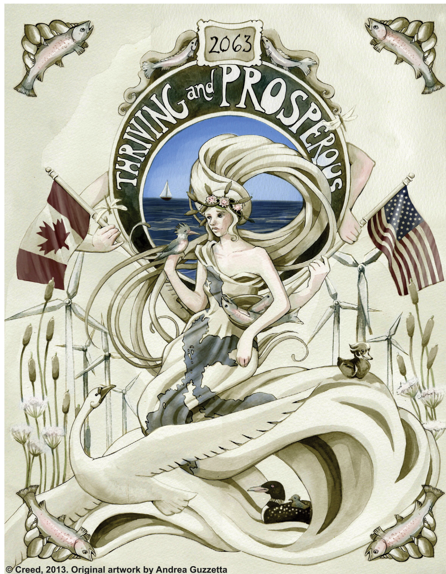
Fig. 2. Original artwork illustrating the outcomes of a “thriving and prosperous” scenario for the Great Lakes–St. Lawrence River region in the year 2063.

to sustain the transition toward low-carbon energy sources, and utilities were also required to use a portion of their operating revenues to support the development of residential, commercial, and industrial energy-efficiency programs. The CAN-AM Clean Energy Initiative also limited emissions from passenger and freight transportation. By 2050, many passenger vehicles were powered, at least in part, by electricity. However, this was not the case for the freight transportation sector. Through the GLERI, port electrification projects were funded for major Great Lakes basin ports including Montreal, Hamilton, Cleveland, Toledo, Detroit, and Duluth in 2053, and completed by 2056 (Fig. 1). This allowed Great Lakes basin commercial marine vessels to plug in to shore-power delivered by the (now cleaner) electric grid. This greatly reduced air pollution in near-port communities, leading to health benefits. In 2053, electric rail projects were in the works for major freight corridors and the first long-haul electric freight rail in the region made its inaugural run between Toledo and Buffalo in 2058. Finally, heavy-duty trucks were finding novel ways to reduce their fuel consumption and emissions through new technologies, including all-